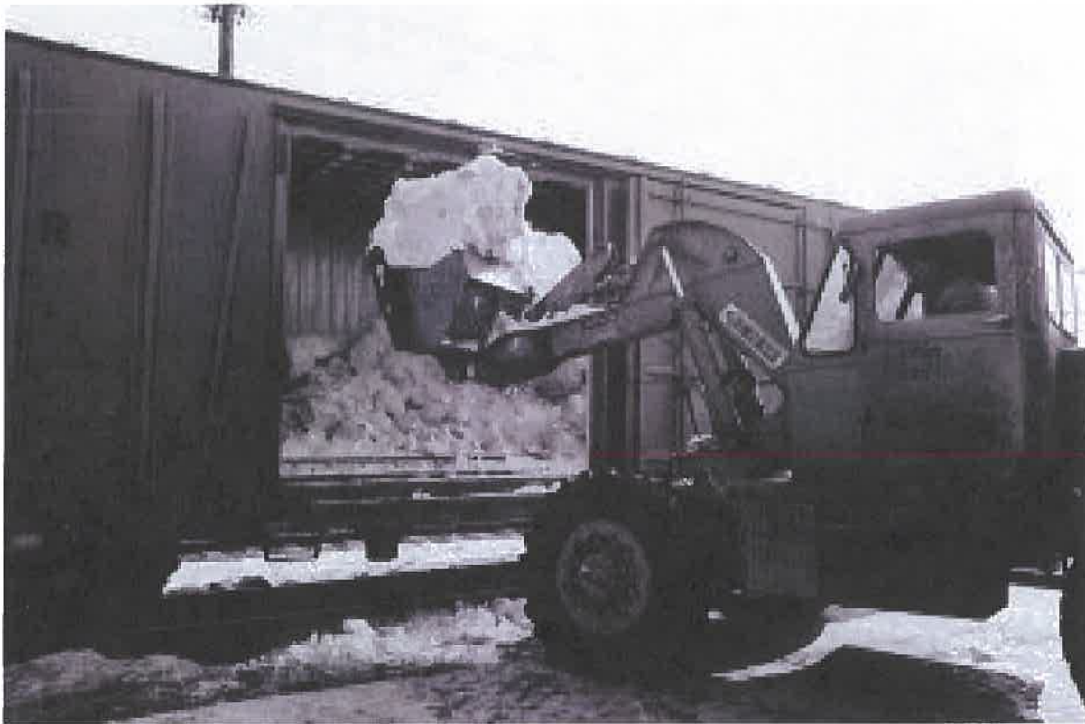
Packing snow in a refrigerated rail car to send to Florida, February 20, 1967