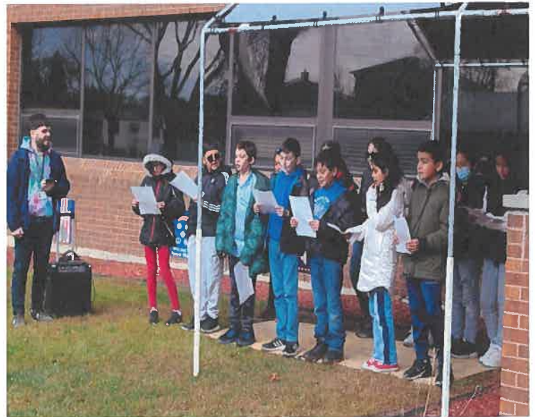
Home Elementary School Choir