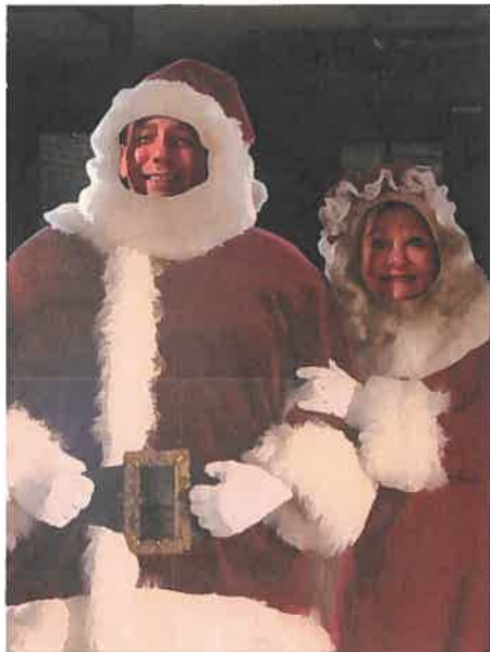
Stop in the Village Hall for a cute photo opportunity.