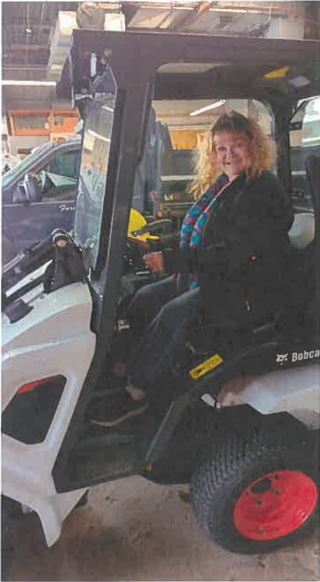
“Warm drinks and tips accepted”